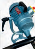
Shaft Grinder SPEEDO 120