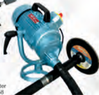
Shaft Grinder SPEEDO 58